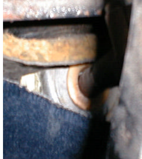
Old bush still in place

(1) First of all remove the clamp half way up the steering column on the inside of the car this will allow you later to slide the steering shaft up into the column. The purpose of the clamp is to allow the steering column to collapse in the event of an accident.